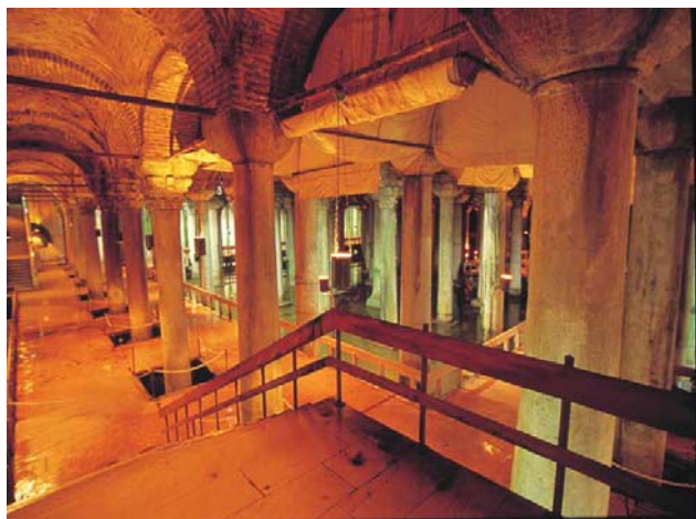
Basilica Cistern / Yerebatan Sarnıcı